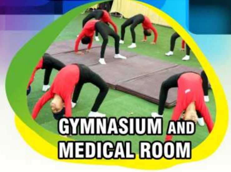
GYMNASIUM AND MEDICAL ROOM

The school has provisioned a big hall for yoga classes for the students of this school where the students learn to perform Asanas and Pranayam which make them healthy, energetic and effective.